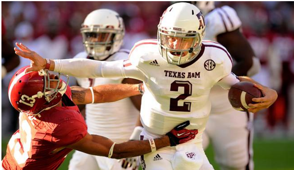
JOHNNY MANZIEL THREW FOR 253 YARDS AND RAN FOR 92 AS THE AGGIES STUNNED ALABAMA AND SHOOK UP THE NATIONAL TITLE RACE.