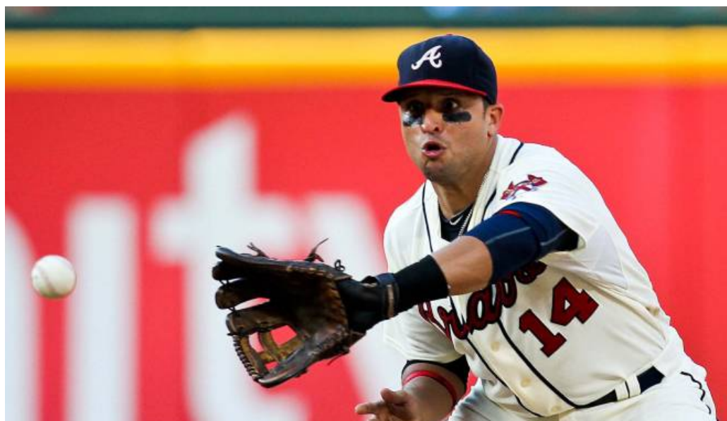
MARTIN PRADO, PART OF A GIFTED BRAVES OUTFIELD, PLAYED SOME SHORTSTOP LAST WEEKEND VS. THE METS.