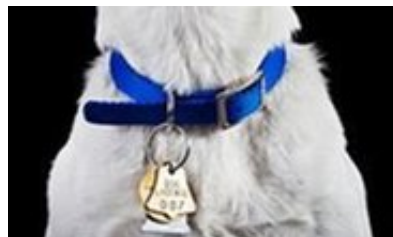
Heart-touching video shows dog trying to get love from Down...