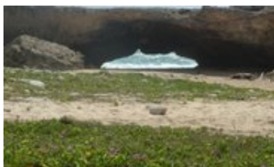
See Stunning Photos of Aruba's North Coast (Aruba)