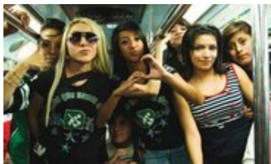
Mexicalia: The Subway Gangs of Mexico City (Vice)