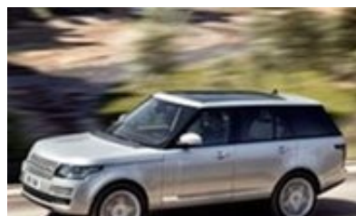
Here Are the 5 Top Luxury SUVs of 2013 (Mainstreet)