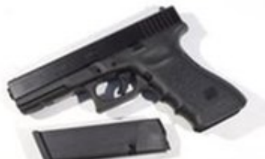
Man accidentally shoots, kills girlfriend during hug